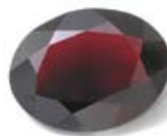
GA1O 26.53 ct 24 x 18.50 mm Oval $628.79